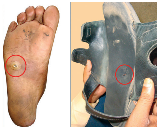
Fig 3. A thorn penetrating a soft outer sole of the footwear caused an injury in a person with a neuropathic foot

We postulate that footwear straps could produce a low-pressure ulcer by one of two mechanisms: (i) people with neuropathic feet tend to use a tight-fitting non-adjustable strap to prevent footwear from slipping off. This is likely to produce a low-pressure ulcer on the dorsum of the foot due to neuropathic numbness. Such pressure and ulceration may become further aggravated if the patient has oedema; and/or (ii) both the toe-grip strap and the hard inner sole of footwear can cause low-pressure ulcers because patients with neuropathy tend to hold the toe-grip strap of sandals tightly in their first web space to prevent footwear slipping off. Such low pressure exerted on the web space and tip of the toes for a prolonged period, especially if the insole of the footwear is hard, results in ischaemic necrosis, particularly if vascular degeneration is present.<sup>22</sup> Figure 4 depicts a FFU caused by such a mechanism.