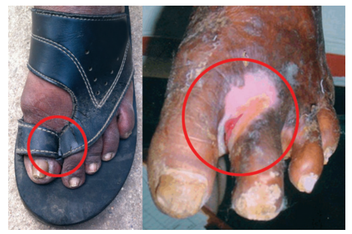
Fig 4. A plantar ulcer (common site) because of gripping the footwear's toe-grip strap tightly for a long time

Toe-grip sandals are popular among the Indian population, as